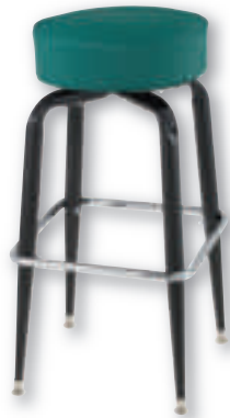
ROY 723 - Black Frame