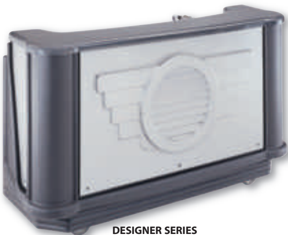
DESIGNER SERIES Shown in Manhattan (667)

Post-mix models also available with 17 gallon water tank and 110V or 220V pump. Ask your sales representative.