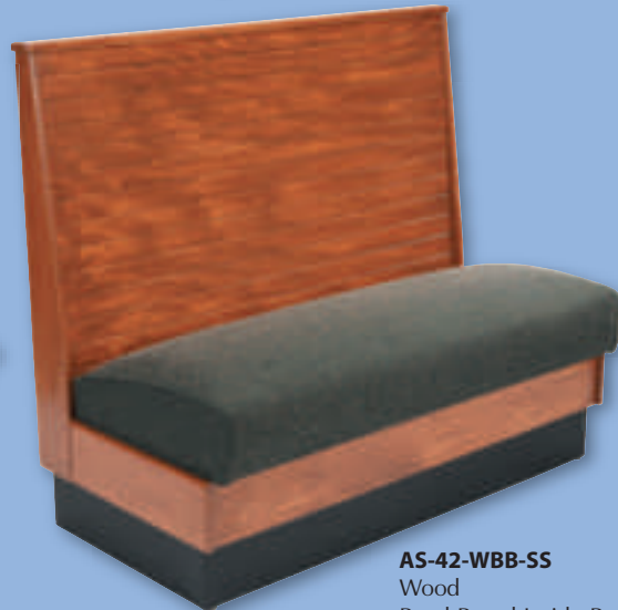
AS-42-WBB-SS Wood Bead Board Inside Back