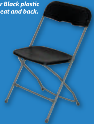
ROY 724 - Folding Chair

Folding chair available in Mocha, White or Black plastic seat and back.