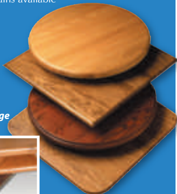
Standard edge profiles