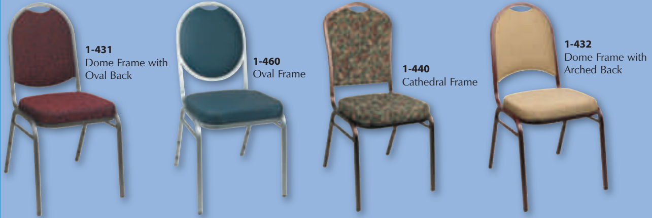
1-431 Dome Frame with Oval Back

19 Touchstone™ Frame Finishes & 11 Seat Styles to choose from