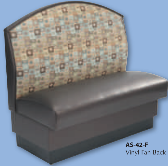
AS-42-F Vinyl Fan Back