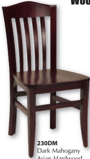
230DM Dark Mahogany Asian Hardwood

Other Available Finishes: Cherry & Walnut