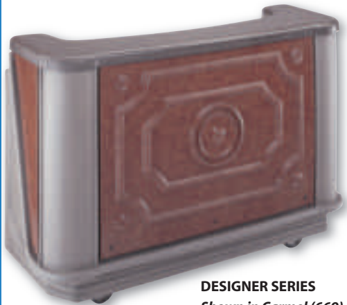
DESIGNER SERIES Shown in Carmel (669)

Beverage service is one of the most profitable parts for a restaurant, caterer or hotel. Cambro's full line of portable beverage bars provides additional opportunities for hosting in any environment - inside or out, small or large, formal or casual. Cambro's portable Cambars are unmatched for their durability and efficient engineering. The Designer Series offers optional appearance upgrades to add to any ambience. Select among three sizes, a variety of equipment options and an array of colors and designs. With these choices, there is a Cambar perfect for any occasion. And whichever you choose, the Cambar will bring new meaning to entertaining profitably!