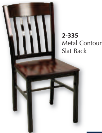
2-335 Metal Contour Slat Back