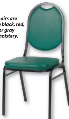
ROY 719 - Round Back