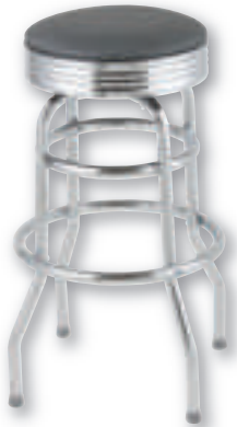
ROY 710 - Classic

Bar stools available in black, red, green, gray, brown, crimson or our NEW two tone* vinyl upholstery.