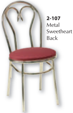
2-107 Metal Sweetheart Back