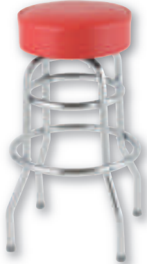
ROY 711 - Single Ring ROY 712 - Double Ring