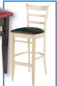
ROY 7001 - Ladder Back Chair