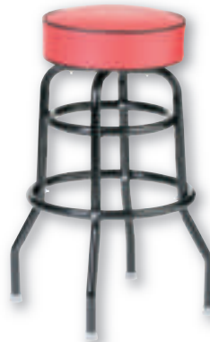
ROY 812 - Black Frame *Shown w/Two Tone Seat (Red w/Black Welt). Call Your Dealer For Color Options!

Folding chair available in Mocha, White or Black plastic seat and back.