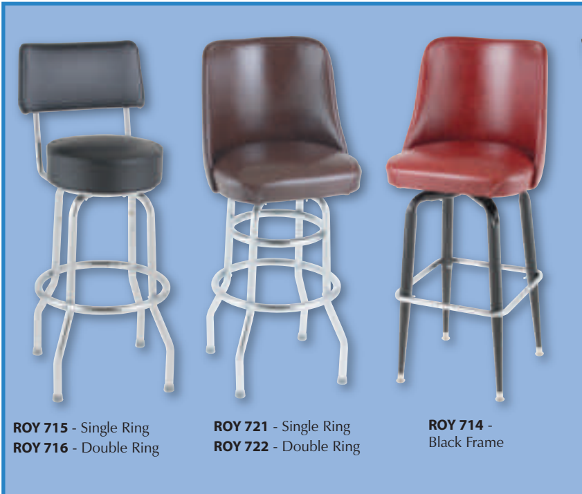
ROY 715 - Single Ring ROY 716 - Double Ring