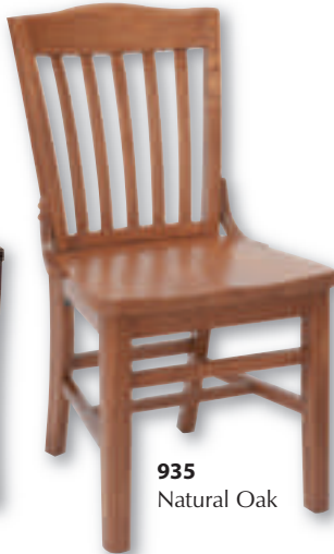
935 Natural Oak

Other Available Finishes: Cherry & Walnut