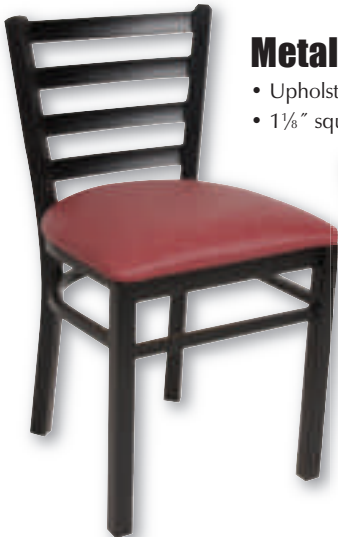
77 Black Textured Powder Coated Frame