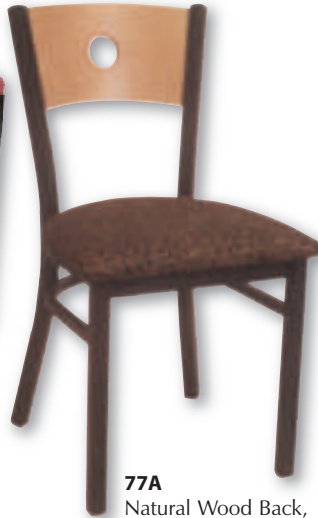
77A Natural Wood Back, Textured Powder Coated Frame