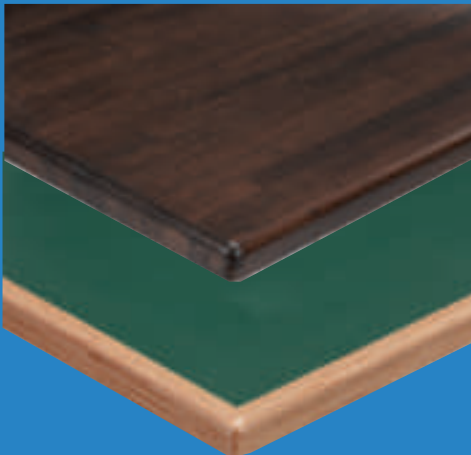
W2424 Solid Wood Butcherblock